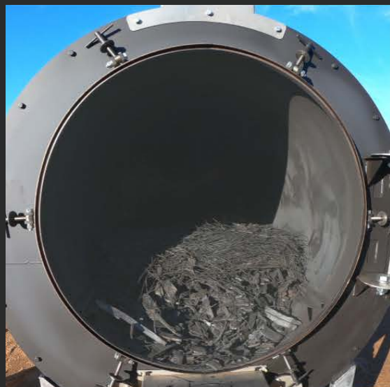
THATCH GRASS & OAK PLANKS MIX