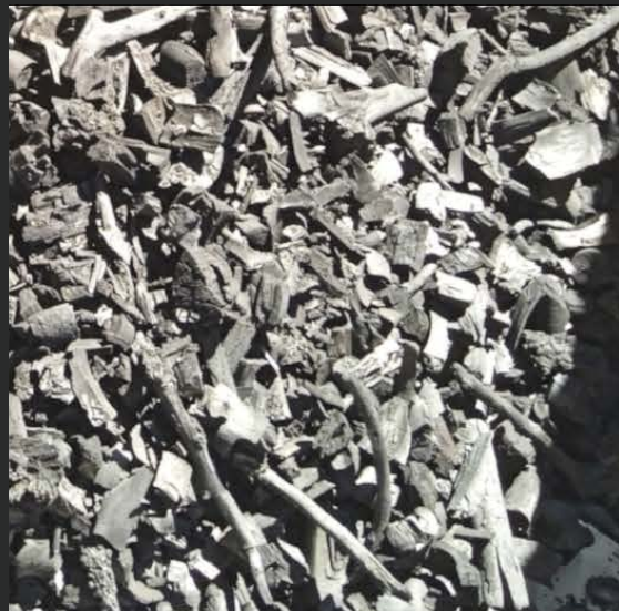
PORT JACKSON INVASIVE