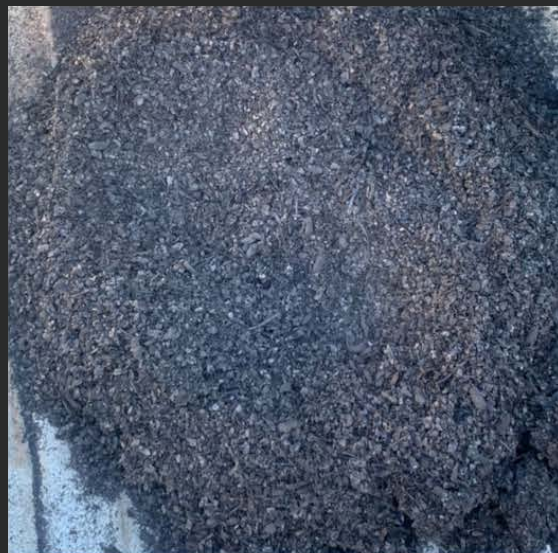
AGRICULTURAL WASTE MIX