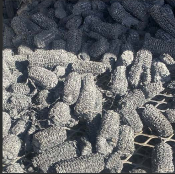
CORN COB WASTE